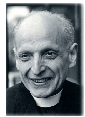
Fr Pedro Arrupe SJ